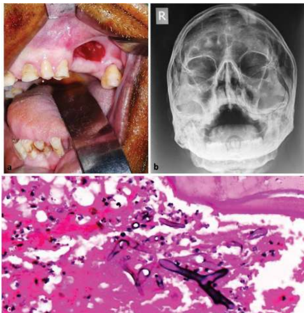
Fig. 1: [Case 1] (Clinical presentation of the disease as oroantral fistula (a); Water's view radiograph showing involvement of left maxillary sinus (b). Photomicrograph (H & E stained section; 40X magnification) showing broad and aseptate fungal hyphae with area of necrosed bone (c).

A 52 years old male patient, farm labourer by occupation presented with complaint of escape of fluid from nose after taking liquids and foul smell from mouth since past one week. Patient gave history of multiple teeth extraction one month earlier at a local private clinic. No contributory medical and family history was reported. Intraoral examination revealed an area of dehiscence over left maxillary alveolus with an oroantral fistula (Fig. 1a).