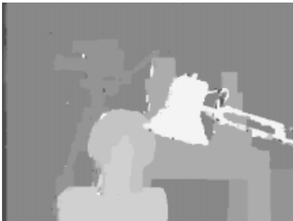
Boykov-Veksler-Zabih results [7]