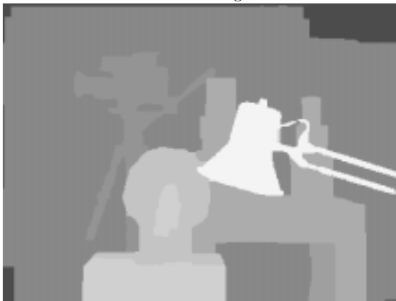
Our results - 4 interactions