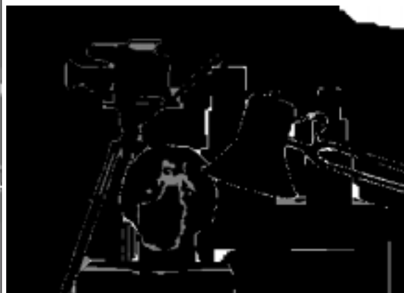
Comparison of our results with ground truth