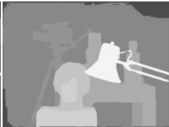
Our results - 10 interactions