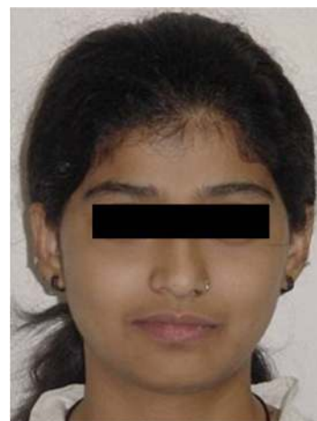
Figure 1 Pre-treatment frontal at rest.