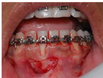
Figure 4 Lower arch vestibuloplasty.

was placed. The patient has been under regular follow-up for the last 18 months and there has been no sign of attachment loss.