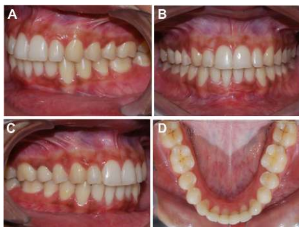
Figure 7 Post-treatment intraoral photographs.

In the present case report the alveolar bone covering the lower right central incisor was thin both on inspection and palpation. Hence the option of full thickness graft was kept open from the initial phase of diagnosis and treatment planning.