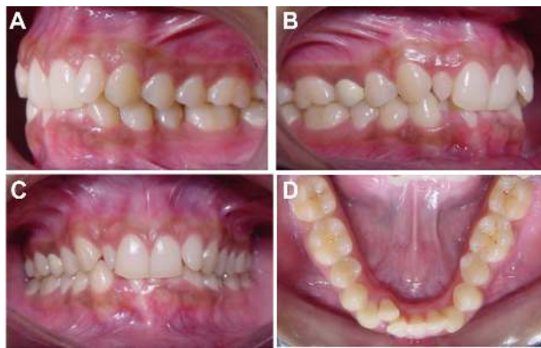
Figure 2 Pre-treatment intraoral photographs.

Notes: (A) Buccal left, (B) buccal right, (C) anterior view, (D) mandibular occlusal.