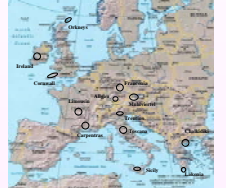
Figure 1: Authentic lamb sampling areas in Europe used in this study

Previous inter-laboratory tests had demonstrated that preparation and stable isotopic measurement gave identical results taking into account the analytical uncertainty of the entire procedure. The uncertainty of measurements was typically ±0.2‰ for δ 13 C, ±0.3‰ for δ 15 N, ±0.4‰ for δ 34 S, and ±3.0‰ for δD.