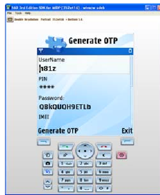
Figure 3: Snapshot of the client OTP program.

In order to setup the database, the client must register in person at the organization. The client's mobile phone identification factors, e.g. IMEI, and SIM card info, e.g. IMSI, are retrieved and stored in the database, in addition to the username and PIN. The J2ME OTP generating software is installed on the mobile phone. The software is configured to connect to the server's GSM modem in case the SMS option is used. A unique symmetric key is also generated and installed on both the mobile phone and server. Both parties are ready to generate the OTP at that point.