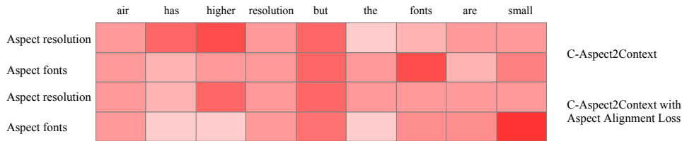
Figure 2: The attention visualizations on aspect “resolution” and “fonts”. The above two bars are from the C-Aspect2Context attention mechanism, and the two bars at bottom are from the C-Aspect2Context attention mechanism with the constraint of aspect alignment loss.

tion mechanism to compose the MGAN model. In addition, we design an aspect alignment loss to characterize the aspect-level interactions among aspects, which have the same context and different sentiment polarities, to explore extra valuable information. Experimental results demonstrate the effectiveness of our approach on three public datasets.