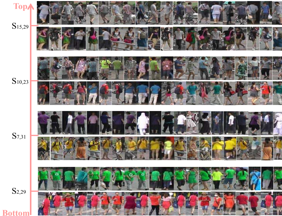
Figure 3. Four groups of images corresponding to highest (first row) and lowest (second row) values of four FSM outputs S_{n,i} , from bottom to top level respectively. Best viewed in colour.