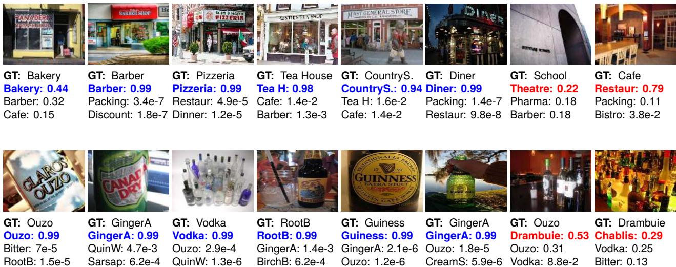
Figure 3. Classification predictions. The top-3 probabilities of a class are shown as well as the Ground Truth label performed on the test set. Without recognizing textual instances some images are extremely hard to classify even for humans. Text in blue and red is used to show correct and incorrect predictions respectively. Best viewed in color.

and textual signals coming from a single image. Classified samples such as “Pizzeria”, “Tea House” and “Diner” often contain similar semantic classes ranked on second and third positions. Images belonging to the Drink Bottle dataset on the second row, are correctly classified even though text instances belong to specific brands, thus showing generalization capability of our method. The seventh image on the first row is wrongly classified as “Theatre” due to OCR recognition errors and a lack of strong enough visual cues. The remaining wrongly classified images are very challenging and contain some degree of ambiguity even for humans.