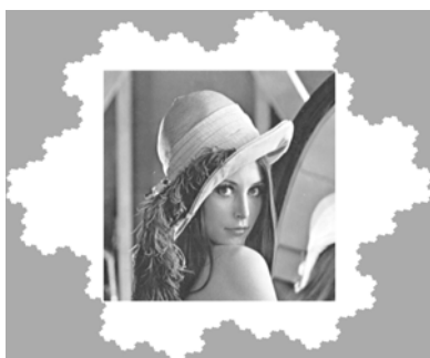
Figure 2: 'Lena' in Spiral Space.

Because currently there is no supporting hardware for Spiral Architectural sampling, a mimic system was introduced by Dr He [11]. The mimic system retains the organizational character of the original Spiral Architecture. Hence it inherits the computational power of the original structure. In the mimic system, one hexagonal pixel is formed by four neighbouring pixels in the traditional system and its gray scale value is the average of those four pixels values. Figure 2 is a sample image represented in mimic Spiral Architecture.