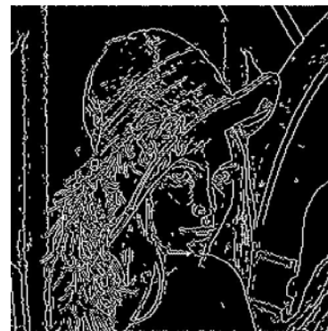
Figure 4: Final edge map of ‘Lena’ obtained from multi-scale edge detection with bilateral filtering.