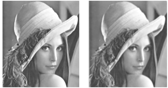
Figure 3: Comparison of results from bilateral filtering (left) and linear Gaussian filtering (right).

The magnified portion of the result with bilateral filtering is clearly less blurry than that of the result with linear Gaussian filtering. Figure 4 is the final edge map of ‘Lena’. Another classic test image ‘peppers’ was used to test the edge detection algorithm. The original image and corresponding result is shown in Figure 5.