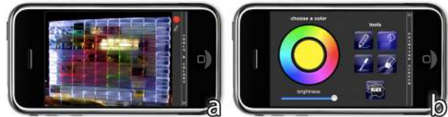
Figure 4. To keep the drawing canvas as large as possible (a), users can switch to the tool palette (b).

Our first application allows users to solve a 15-puzzle on the facade. Eight pixels (i.e., 2 by 4 windows) are representing one tile of the puzzle. Tiles can be shifted by tapping on a tile next to the missing one. However, the facade's low resolution did not allow for clearly showing division lines that are important to identify tiles (see Figure 3a). We decided to allow users to superimpose these lines on the mobile device to allow for tile identification (see Figure 3b). As our tiles only have 8 pixels in total, it is hard to identify a tile's correct location. Users can peek at the solved puzzle by requesting a preview (see Figure 3c). We decided to show the preview locally so that others are not distracted.