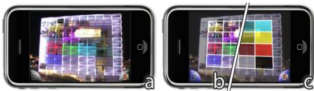
Figure 3. On request, the original video image of the puzzle (a) is augmented with a grid (b) or a preview (c).

Aside from determining the spatial relationship of mobile devices, the server stores individual content for each user as image data which (on request) can be transferred to the mobile device. In some cases (i.e., directly superimposing individual content), the system also distorts the content for correct alignment with live video. This is done by using the inverted transformation matrix (i.e., homography) calculated during the detection process. Once the image is sent to the mobile device, it is overlaid on the live video image.