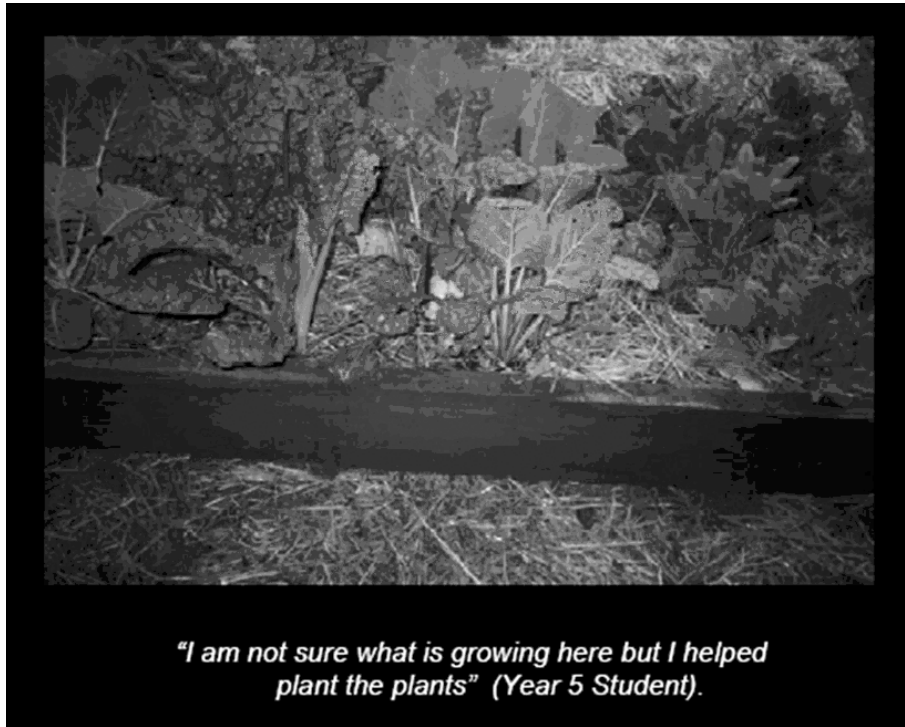
Figure 2. Growing Food, Rather than Knowing Food.

ronmental [sustainable] than buying food from the supermarket" (journal entry, year 4 student). When asked to explain further, he said "because the food goes from the ground to plate and doesn't have to come so far." While this was a particularly insightful and critical view that the student adopted, this student did not make the link between the ideal of growing your own food and having the knowledge to grow (or harvest) food (as shown in Figure 2). It is clear though that children are looking for a nature or environment connection through gardening (Wake, 2008), particularly one that makes them feel empowered in their environmental behaviour and actions. However, the kind of deep interconnectedness and relationships described by Mayer-Smith, Bartosh and Peterat (2007) were not visibly evident among this group of students. Practice (and inquiry) over a sustained period of time, though, may lead to such interconnectedness that in turn filters into other aspects of the students' lives.