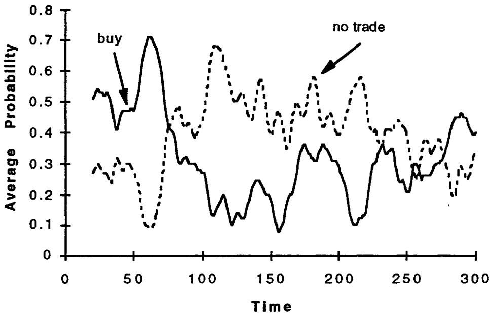
Figure 2: Trading Activity (moving average)

With extreme event uncertainty, the price is quite stable for the first 25-30 periods. During this initial interval, however, Figure 2 shows a large build-up of buy orders, which is due to herding. Three of the first five traders buy and this is enough to prompt L types to engage in herd buying. Herd buying lasts from period 5 to period 56. As in the case of event uncertainty alone, the market maker continually increases his assessment of the likelihood of an informational event as buy orders continue to arrive at a high rate. However, unlike the case of event uncertainty alone, the price moves dramatically as the market maker concludes that there has been an information event.