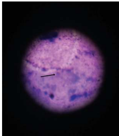
FIGURE 6: FNAC from breast lesion showing degenerated inflammatory cells in a necrotic background.