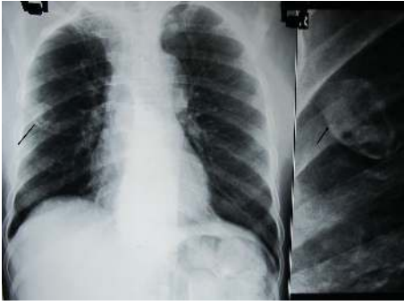
FIGURE 1: Arrowhead showing an expansile lesion involving right 4th rib.

progressive weakness of all four limbs for past two months along with decreased sensation in both lower limbs and tingling sensation in all four limbs now presented to us with development of retention of urine for the last four days. Two months back she had a preceding history of low grade fever for about one week which subsided spontaneously but she developed a persistent dull aching neck pain along with a gradually progressive quadriparesis. She had no history of anorexia, weight loss, cough with expectoration, hemoptysis, or any lump elsewhere in body. Examination of general survey was unremarkable except for the presence of mild pallor. Neurological examination revealed grade 3 power in both lower limbs and grade 4 power in both upper limbs, spasticity of all four limbs with exaggerated deep tendon reflexes in all 4 limbs, and bilateral extensor type of plantar response and hypoesthesia of both lower limbs but there was no definite sensory level. There was mild hepatosplenomegaly.