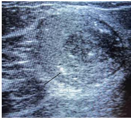
FIGURE 5: USG of right breast showing hypoechoic, heterogeneous mass lesion with echogenic foci (arrowhead).