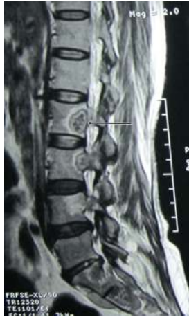
FIGURE 4: Arrowhead showing altered marrow signal intensity with abnormal soft tissue lesion at L2 vertebra.