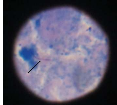
FIGURE 7: ZN stain of FNAC material from breast tissue with arrowhead showing acid fast bacilli.