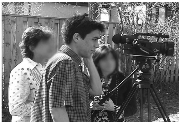
FIGURE 2 Researcher filming narration with a participating family.

The researchers then imported the assets into a digital video editing suite. The timeline structure common across many video editing suites allowed for visual elements such as titles, images, and video clips to be sequenced with narration and/or music. During the project, four different software packages were used, as our process did not depend on a particular package. MBs were edited by the researchers who compiled the story through the creative combination of materials provided by the families. Additionally, thematic backgrounds and templates were drawn from the editing programs. Using visual and audio media, the researcher produced test