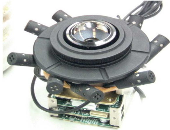
Figure 5: The new 'coffee-cup-sized' sensor - a SONY RPU-C251 Chameleon Eye with a ring of Audio Technica radio microphones

Output from the video capture device is currently at 12 frames per second, for tracking face and hand movements only, and the audio is summarised at 100 frames per second. A smoothing algorithm is used to keep track of the video object IDs. The centre of gravity of each object is provided in a low bit-rate output data stream, along with information describing the object motion in rectified coordinates. Posi-