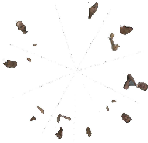
Figure 4: The 360-degree view after skin-tone detection. These are the moving parts that we track

variations in overall sound quality around the table. From this information, in conjunction with the video primitives, we are attempting to produce an estimate of each speaker's activity throughout the meeting.