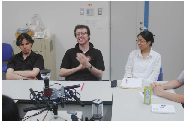
Figure 2: The device is relatively unobtrusive in actual use and does not hamper the interactions

scribing the body, hand and head movements is produced automatically.