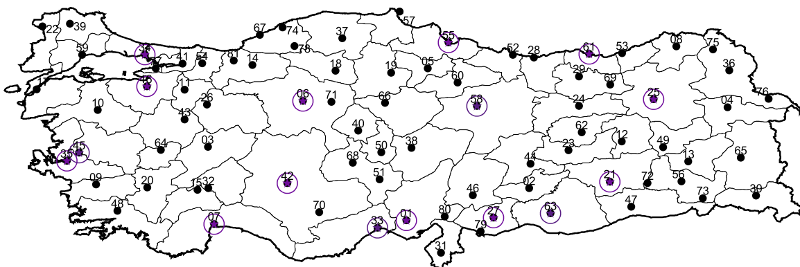
Fig. 1. The 81 demand nodes and the 16 candidate hub locations on the Turkish network.

Travel times using ground transportation are calculated assuming a travel speed of 80 km/h whereas travel times for using air transportation are estimated by assuming that the airplanes travel at a speed of 700 km/h. Since ground transportation can be used on the allocation links as well as on the hub links, we take \alpha_r^g = 0.9 as suggested by Tan and Kara [41]. On the other hand, since air transportation is available only between hub nodes, the air travel times correspond to their respective discounted values. Moreover, the unit operational costs and operational times are assumed to be embedded in the respective cost and time parameters.