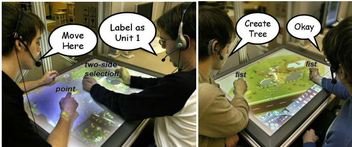
Figure 1. Two People Interacting with (left) Warcraft III, (right) The Sims

game system. Finally, we could explore the effects of multimodal input on different game genres simply by wrapping different commercial products. The two games we chose are described below.