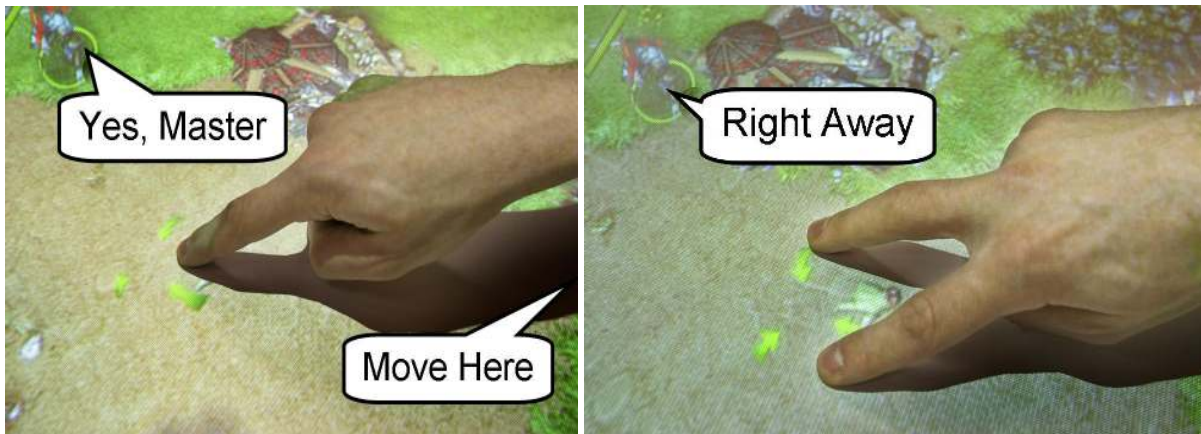
Figure 4. Warcraft III: 1-finger multimodal gesture (left), and 2-finger multimodal gesture (right)

then say ‘Build Barracks’ while pointing to the location where it should be built. This intermixing not only makes input simple and efficient, but makes the action sequence easier for others to understand.