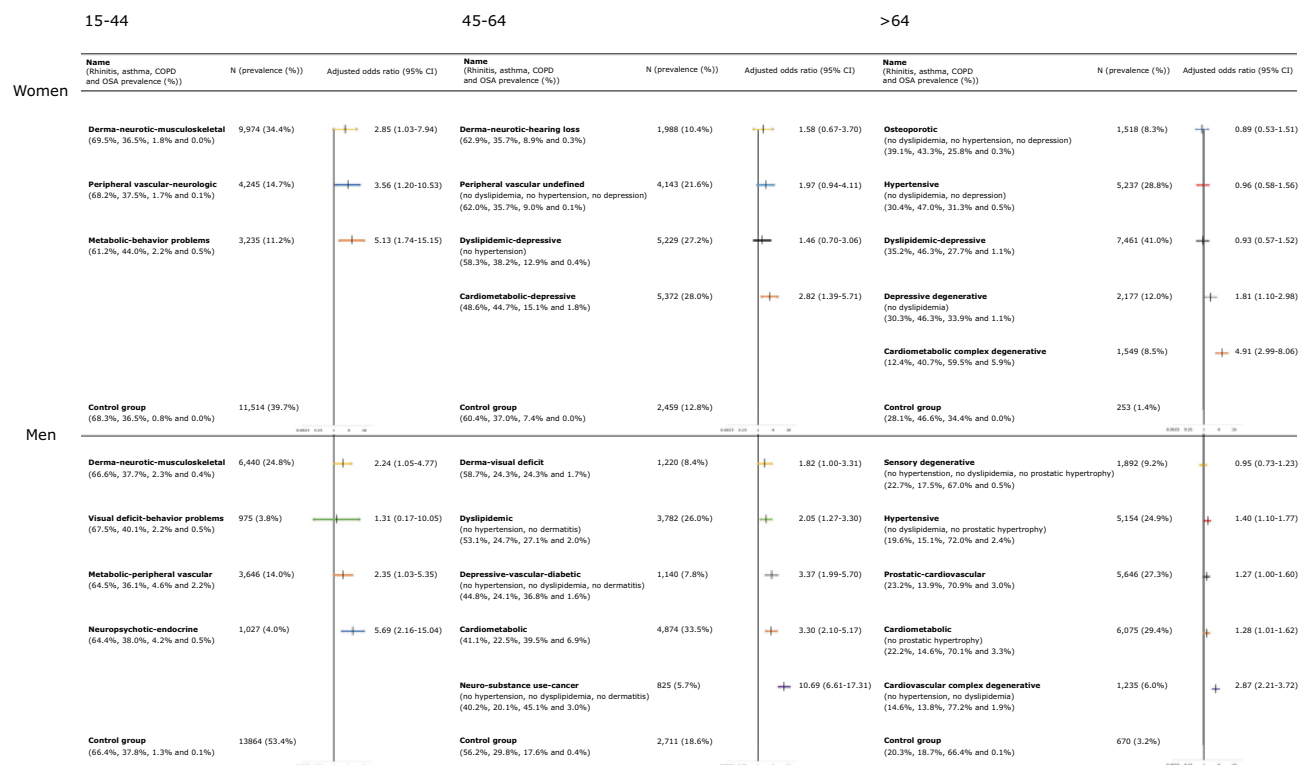
Figure 1. Prevalence of multimorbidity clusters in the study population based on gender and age, and odds ratios of association with mortality. COPD chronic obstructive pulmonary disease, OSA obstructive sleep apnea.

In women aged 45–64, four clusters were observed. The cardiometabolic-depressive cluster with conditions such as hypertension, obesity, dyslipidemia, varicose veins, and depression was the most prevalent and with the highest mortality risk associated. We also found a dyslipidemic-depressive cluster that included only dyslipidemia and depression, a derma-neurotic-hearing loss cluster with conditions such as dermatitis and eczema, anxiety, deafness, and irritable bowel syndrome, and an undefined peripheral vascular cluster, all of which were not associated with increased mortality risk.