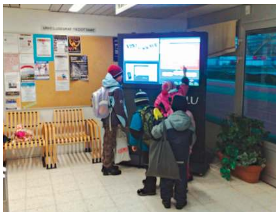
Figure 1. A hotspot at a sporting facility in Oulu, Finland. This public display employs a 57-inch touchscreen interface to provide access to many applications.

We looked at hotspots in Oulu, Finland—networked nodes that can serve many applications through their 57-inch touchscreen interface. 2 We focused on the hotspot in the lobby of a large sports facility that was available to all visitors during the facility's operating hours (see Figure 1). The facility also serves as a space for concerts, youth fairs, exhibitions, and so on. We focused on a single display to account for any environmental effects on use—keeping the environment as constant as possible makes the rest of the analysis more tractable. The hotspot has housed nearly 50 different applications