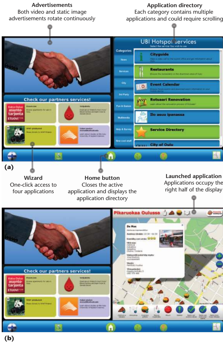
Figure 2. The hotspot interface in fully interactive mode: (a) displaying the application directory and (b) launching a map application. The screen is divided into the broadcast channel (the upper-left quarter), the wizard (the lower-left quarter), and the main application area (the right half). The screen's bottom part has a control bar housing the start button, which displays the application directory.

Table 1 summarizes the applications and their placement in the wizard and directory in each period. Each application was either in both the wizard and directory or just in the directory.