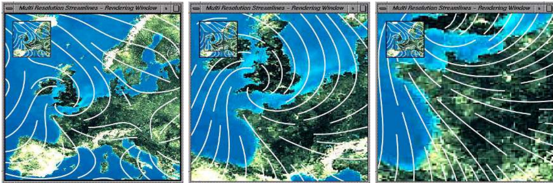
Figure 2: Three snapshots of an interactive exploration of a vector field using our multiresolution viewer. The suitable level of the hierarchy is selected at any time to maintain a roughly constant density of streamlines.

disturb the observer. In [4] we have proposed such kind of mechanism for handling the apparition and disappearance of streamlines in the context of visualization of time-varying vector fields.