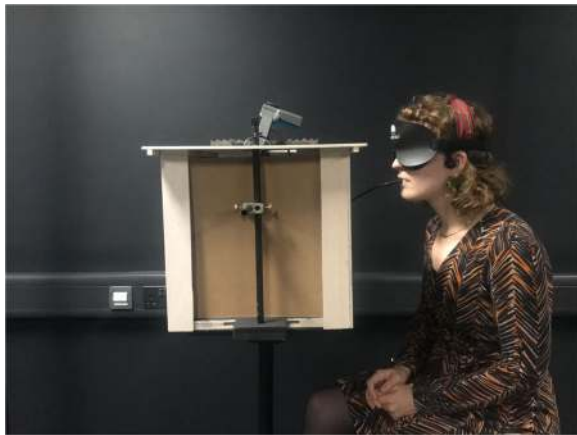
Fig. 3 Image showing a user wearing an auditory-tactile cross-modal display prototype. The tactile information is created by BrainPort, a visual-to-tactile sensory substitution device. The auditory information is created by The vOICE, an auditory-to-tactile sensory substitution device. The camera fixated within the box provides real time feed to BrainPort and The vOICE. As a result, the user can perceive the camera feed via audio, tactile and audio-tactile cross-modal feedback

users in tactile, sonification or tactile-sonification forms. Here, the user can acquire spatial information necessary for navigation via electro-tactile stimulation on her tongue and also via sonifications which are delivered by bone conduction headphones (Jicol et al., 2020). The cross-modal display prototype here applies the principles of spatial and temporal coincidence by aligning the sensory information available to the camera. This is simply achieved by fixating the camera with a scaffold inside a box. The box also ensures the consistency of environmental factors for experimentation purposes. The principle of inverse effectiveness enables users to rely equally on the cross-modal feedback from two novel display modes. This reliance is achieved as users have not previously used BrainPort or The vOICE. From a theoretical perspective, this research investigates the relationship between multisensory integration and multisensory combination and how sensory substitution techniques are represented in multisensory processing. From an applied point of view, this research aimed to develop inclusive cross-modal displays that can efficiently deliver the same sensory information in different sensory forms.