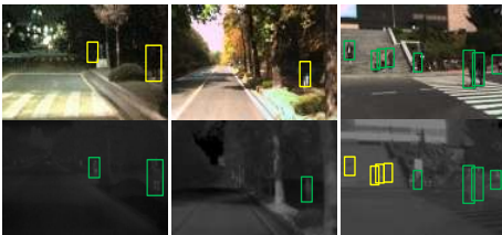
Figure 1: Yellow bounding boxes indicate detection failures with one image channel.

Multispectral pedestrian detection is essential for around-the-clock applications, e.g. , surveillance and autonomous driving. In some sense, color and thermal images provide complementary visual information. As shown in Figure 1, thermal images usually present clear silhouettes of human objects [1], but losing fine visual details of human objects ( e.g. clothing) which can be captured by RGB cameras (depending on external illumination). Nevertheless, except very recent efforts ( e.g. , [2]), most of previous studies concentrated on detecting pedestrians with color or thermal images only. It is still unknown how color and thermal image channels can be properly fused in DNNs to achieve the best pedestrian detection synergy.