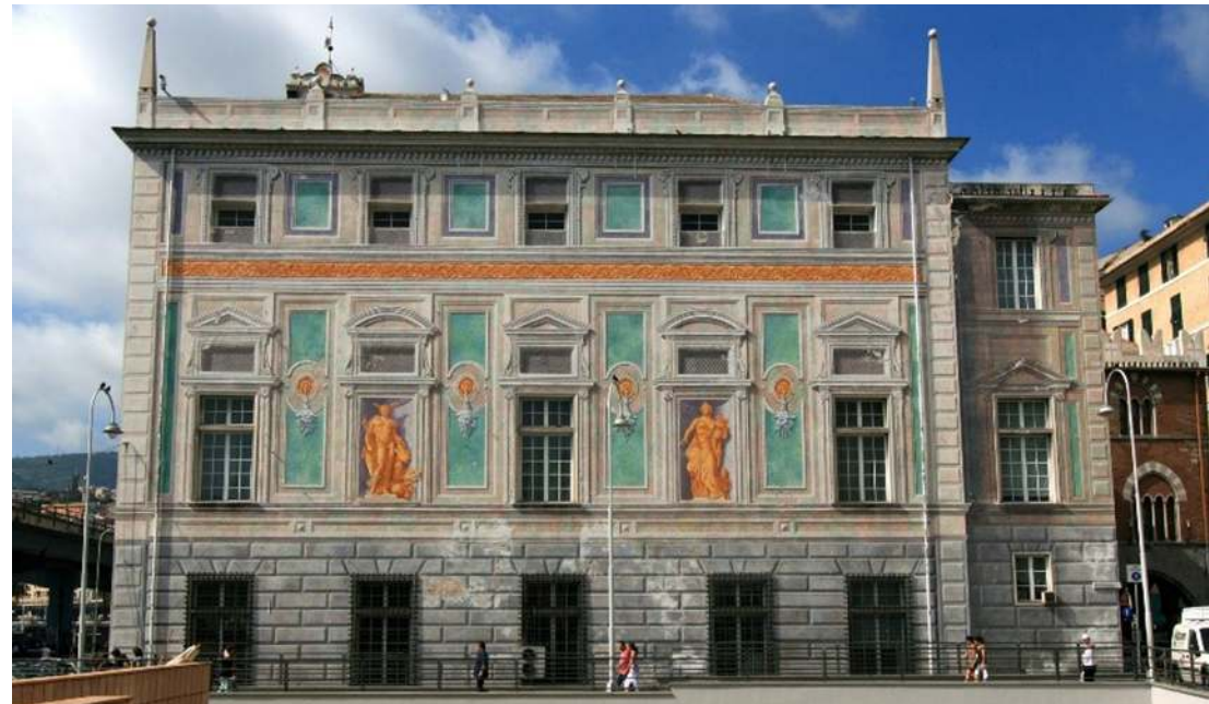
Fig. 4 - Palazzo San Giorgio, Genoa. S XIII – XVI.

The Modern Movement in architecture replaced the Modernism that emerged in the first decades of the 20th century, giving rise to the so-called "International Style", which developed in Europe in the period between the two world wars. However, it was after the second war that it expanded to the rest of the world. It is distinguished by the incorporation of new materials such as steel,