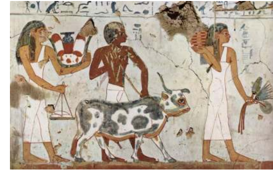
Fig. 1 - Funeral mural painting. Luxor, S XV bC.

This article is divided into four sections. After the introduction, which justifies and helps to contextualize the object, scope, interest, purpose and content of this work, we proceed in a second chapter to review the relationship between mural painting and architecture, including its main milestones