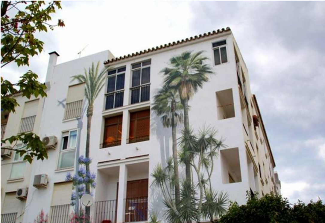
Fig. 7 - Reflejos del jardín

From the perspective of conception, one of the aspects he considers most important is to ignore the division of matter, architectural support, and creative space through the use of trompe l'oeil. Prolonging the sky within the painting, creating virtual spaces, or incorporating the surrounding vegetation are some of the graphic resources he uses. He plays with the architectural environment, shading and perspective, and he invokes the complicity, even emotional, of the observer who ends up being the protagonist of his work.