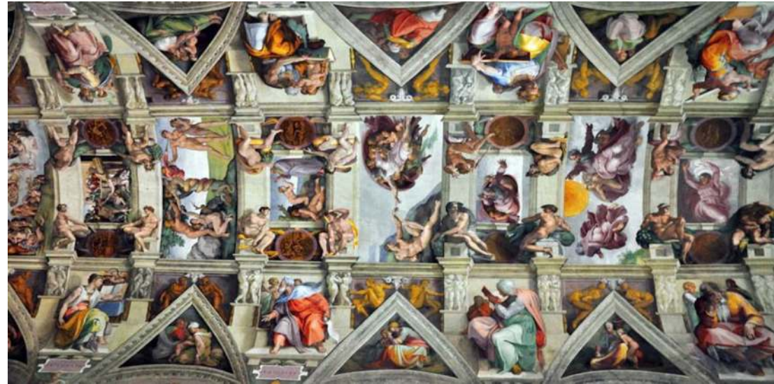
Fig. 3 - Sistine Chapel, The Vatican. S XVI.

Mural art, as an intrinsic component of architecture itself, is a welcome part of architecture. It brings meaning to the building and the architectural space in which it is carried out and which it configures. Historical works of mural art cannot be isolated; they must be considered in accordance with the architecture and the space in which they will be integrated. Contemporary mural art, generally alien to previous architectural design, either brings its own message outside of the architecture itself, which it parasitizes, or intrudes