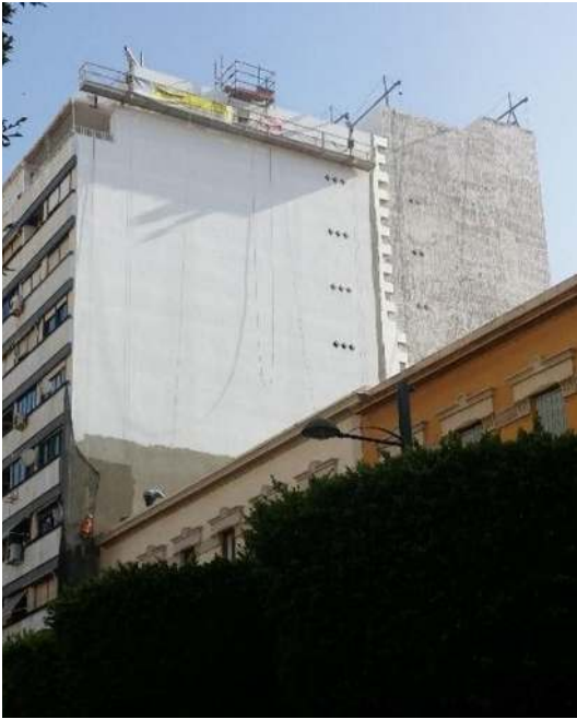
Fig. 15 - Flying kites (Volando cometas). Before.