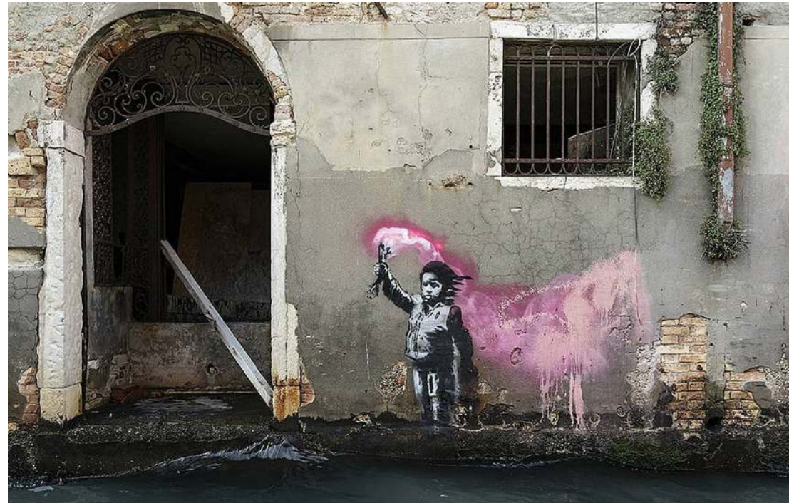
Fig. 5 - Banksy, Migrant child - Venice 2019.