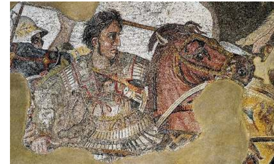
Fig. 2 - Mosaic. Issos battle. Pompeii S I bC.