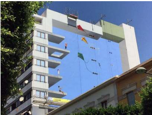
Fig. 16 - Flying kites (Volando cometas). After.