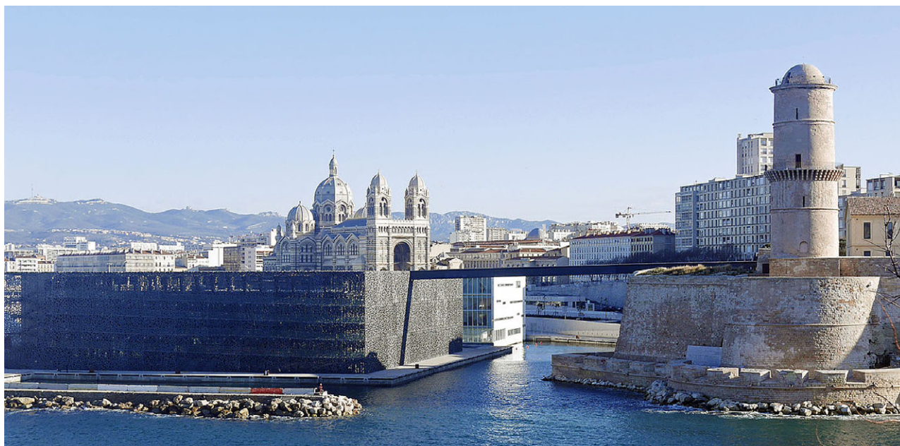
Figure 1. View of MuCEM, including the new building by Rudy Ricciotti on the former J4 pier and the seventeenth-century Fort Saint-Jean. [This figure appears in color in the online issue.]

The complex topography of MuCEM suggests a kind of Mediterranean insularity (see Figure 1). The