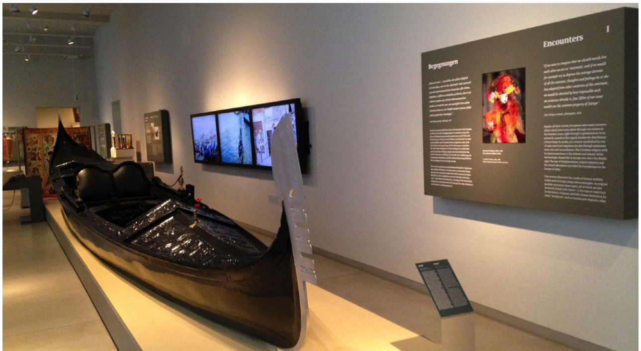
Figure 4. Gondola on display in the MEK. [This figure appears in color in the online issue.]

MEK's permanent exhibit has a Venetian gondola, positioned at the entrance, as its guiding object (see Figure 4); this artifact is meant to symbolize the key exhibition themes—travel,