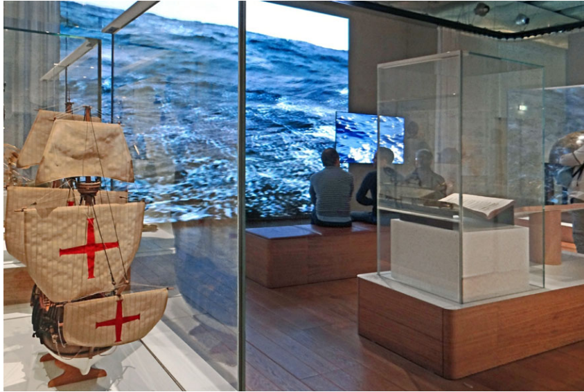
Figure 2. Detail of the section on sea travel in the MuCEM's semipermanent exhibit, the Gallery of the Mediterranean . (2014, Jean-Pierre Dalbéra/Wikimedia Commons.) [This figure appears in color in the online issue.]

Israeli-Palestinian conflicts, or in the video about women's initiatives and another on migration. Yet, the end result is what The Guardian labeled a “muddle” (Moore 2013). One of the two opening temporary exhibits, and a few of the later ones more directly, did address the violence, physical and epistemic, of colonialism and its aftermath; but overall, this is for MuCEM's curators a very “sensitive topic” to be handled with caution especially in the context of France's current tense and racialized politics. 9