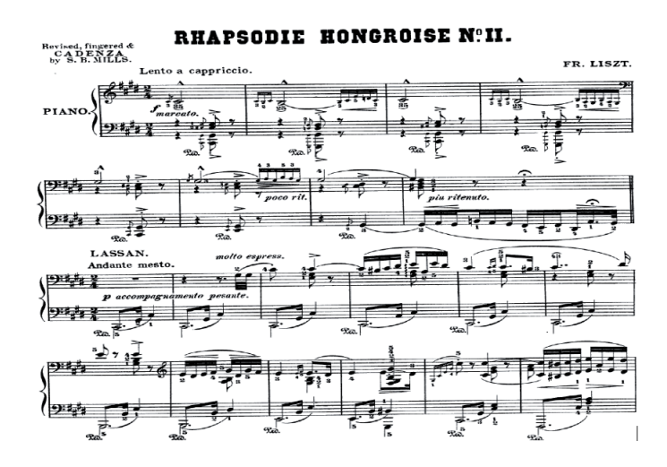
LISZT, F. (1847 [2005]). Ungarische Rhapsodie Nr. 2 [Hungarian Rhapsody No. 2]. Munich: G. Henle.

RACHMANINOV, S. (1893 [1969]). Ne poi, krasavitsa... [Sing not Ome, Beautiful Maiden...]. Opus 4, no.4. Moscow: Muzyka.