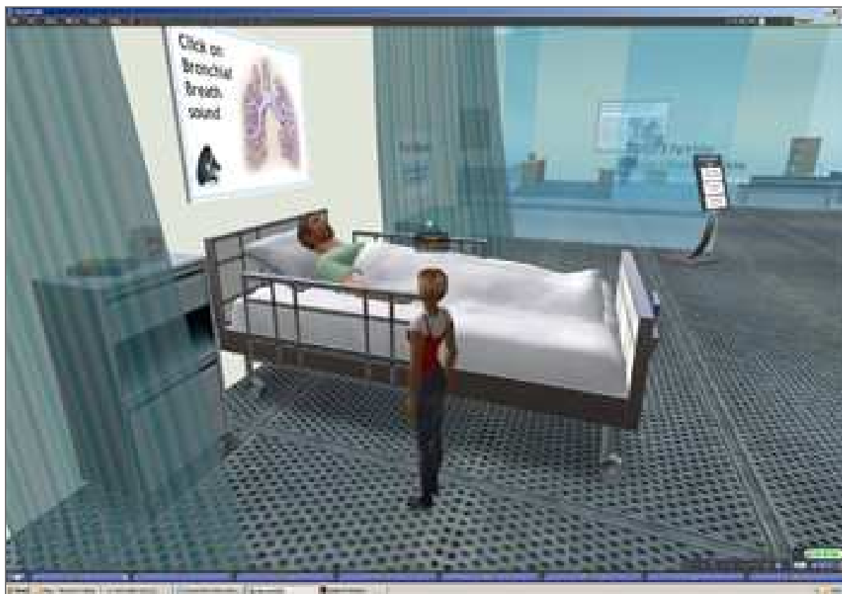
Figure 3. Virtual Patient at the Respiratory Ward – Imperial College London region in Second Life® ( http://slurl.com/secondlife/Imperial%20College%20London/150/86/27/ ).

The Faculty of Medicine at Imperial College London has developed a Respiratory Ward in Second Life® with a series of virtual patients activities following a game-based learning model (Figure 3). The game-based learning activities aim to drive experiential, diagnostic and role-play learning activities within the 3-D world, aiming to support patients' diagnoses, investigations and treatment. The Respiratory Ward was developed with five virtual patients covering (medical history, differential diagnosis, investigations, working diagnosis and management plan). Different narratives and modes of representation were developed within the areas described above (introductions, scaffolding information, diagnostic capabilities, assessment and triggers) (Toro-Troconis et al, 2008b).