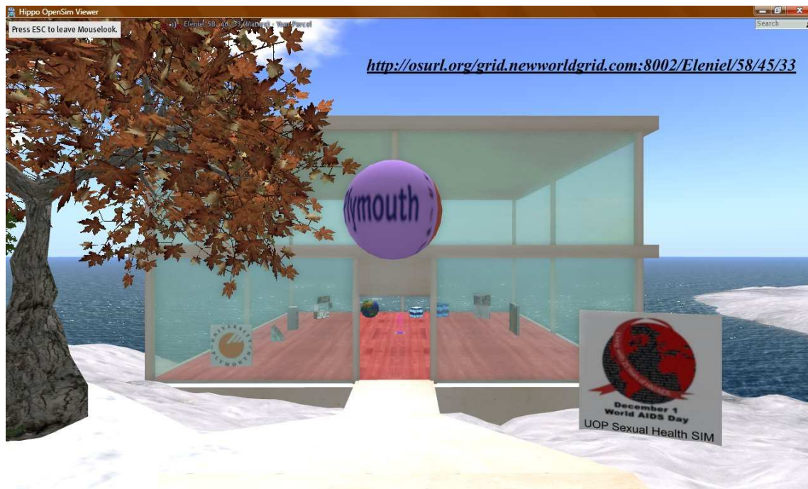
Figure 2. The University of Plymouth Sexual Health SIM on the OpenSim-based New World Grid. Most of the interactive objects that appear in this snapshot were successfully ported unmodified from our primary presence in Second Life® and are fully functional under OpenSim, thanks to the Second Inventory application ( http://www.secondinventory.com/files/products.php ).

Today (in March 2009), the Open Source OpenSim platform ( http://opensimulator.org/ ) and the largely proprietary/closed-source Second Life® are sporting some very welcome inter-compatibility between them. For example, the same software client (Second Life® viewer or Hippo viewer - http://mjm-labs.com/viewer/ ) can be used to visit both OpenSim-based and Second Life® grids. Second Inventory ( http://www.secondinventory.com/ ) allows most (full-permission) objects to be ported (with any associated textures and internal scripts) from Second Life® to any OpenSim grid.