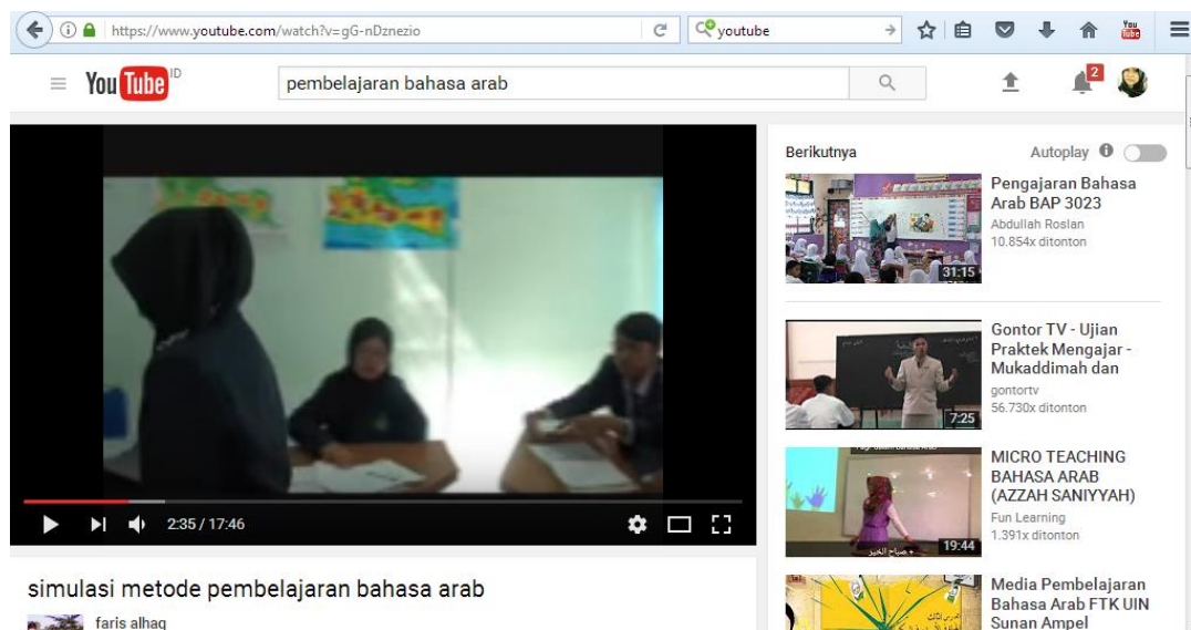
Figure 1. Example of Arabic language teaching methods on YouTube

YouTube-based learning methods can be done educators with varied learning models so that learning is more pleased, interested to learn so that the learning process becomes meaningful learning. By applying YouTube-based learning, students will be accustomed to thinking critically and encouraging students to become independent students (June, Yaacob, & Kheng, 2014). Students will also be accustomed to seeking information from various sources to learn. Moreover, Ebied et.al (2016) explain that another thing that is not less important is that with YouTube-based learning knowledge and student insight develops, can improve learning outcomes, thus the implications for the quality of education will also increase. The example of Arabic language teaching methods can also easily accessed from the YouTube itself, as the example below.