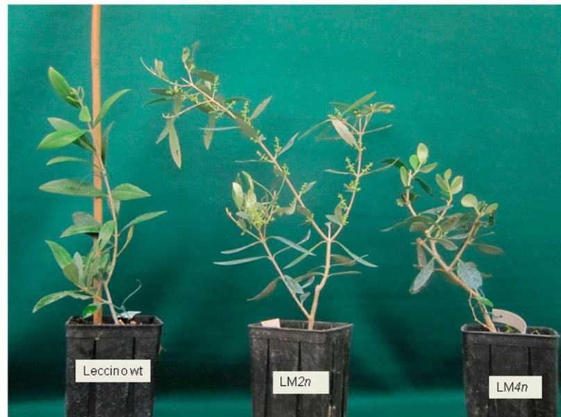
Fig. 2. Potted coeval plantlets derived from subapical cuttings of 5-year-old field-growing plants: note the precocity and high capacity of LM3- 2n plant to differentiate flowers.

The results of the crosses and self-pollination experiments are reported in Table 2. The controlled pollination showed that the FRM5- 4n mutants maintained the typical self-fertility of Frantoio wt , whereas the LM3- 4n , obtained from the notoriously self-sterile cv. Leccino, acquired self-compatibility. Polyploidy can affect sexuality by providing selective advantages