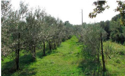
Fig. 4. Self-grafted cv. Canino (left) and Canino grafted on the mutated Leccino (right) in the experimental field (plants at the sixth leaf on field).

Different letters within the groups indicate significant difference at P < 0.01 .