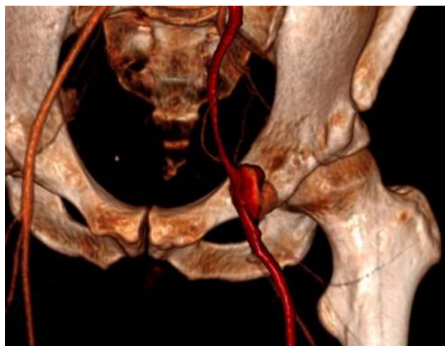
Figure 2 Reconstructed three-dimensional CT angiogram demonstrating a mycotic common femoral pseudoaneurysm at the level of the inguinal ligament. Abbreviation: CT, computed tomography.

The central area of controversy in the management of mycotic pseudoaneurysm of the common femoral artery relates to the surgical strategy and, specifically, the requirement for arterial reconstruction. With each approach, debridement of necrotic tissue and drainage of sepsis must be performed (specimens must be sent for microbiological assessment).