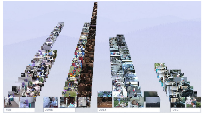
Figure 2: Clustered-time view of query results.

interestingness. We also want to minimize the action needed to have a sense of what something is, so we display thumbnails of increasing size on mouse hover, and have an optional preview window for the selected item. Additionally, there are optional windows to show annotations, collections and children. With all these windows open, you can quickly see what a resource is, and what it is linked to.