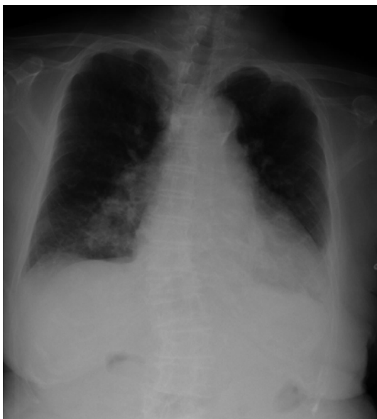
FIGURE 1 A chest X-ray showed enlargement of the cardiac silhouette and bilateral costophrenic angle blunting

Her clinical course is shown in Figure 2. Treatment with oral levothyroxine of 150 µg per day was initiated via a nasogastric tube, and a transvenous temporary pacemaker was inserted via the right femoral vein with a ventricular rate of 60 bpm. Noninvasive positive pressure ventilation (NPPV) was administered because of her respiratory failure. On day 9, the patient developed fever and chills, and two sets (from 4 bottles) of blood cultures tested positive for methicillin-resistant Staphylococcus epidermidis (MRSE). Transthoracic echocardiography showed no vegetation in heart valves. Based on the diagnosis of MRSE bacteremia without any involvement of other sites, intravenous administration of vancomycin was initiated and discontinued 2 weeks after confirmation of negative blood culture. The patient was referred to our hospital for further evaluation and treatment. On admission to our hospital, both TSH and free T4 were normalized. Since her hypercapnic respiratory failure had been improved, NPPV was discontinued. Because her HR was stable around 50 bpm without cardiac pacing, temporary pacemaker was also discontinued. Her cardiomegaly on chest X-ray improved with hormone