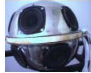
FIGURE 5. "The Bomb"

For the conventional spatial display, the generated sound-field can be thought of as coming from sources spaced around the listener. One can say, that the generated sound-field is locally confined (or simply local) and that the placement of reproduced sources is global. A spherical display, on the other hand, simulates the radiation of one (or a few) local sound sources confined in the space described by the sphere. The radiated sound-field is, however, not inherently confined and hence can be simply viewed as being the global sound-field as generated by the local sources. Hence these two display methods are, in terms of sound-field reconstruction methods, complementary. In both cases, the speakers represent a discrete sampling of the sound-field, but the direction of radiation is inverted. From this it seems like techniques for improving the sampling errors made due to the spacing between the speakers, like panning techniques, can be directly applied to the spherical display. In this sense the distinction between conventional displays and spherical displays can be seen as the first having the speakers pointing inwards (global sources) while the latter having them pointing outwards (local sources), independent of the actual shape.