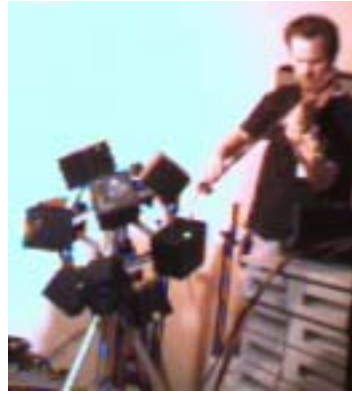
FIGURE 4. "The Boulder"