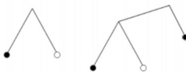
Figure 1. The graphs G_2 for a = 2 (left) and G_3 for a = 3 (right).

and as usual \hat{y} = \hat{z}_1 \hat{z}_2 . Rewriting the second equation \hat{z}_2 P_C = (1 - (-1)^a x_2 (\hat{z}_1^{-1} \hat{y})^a) P_C , and then \hat{z}_1^a \hat{y} P_C = (\hat{z}_1^{a+1} - (-1)^a x_2 \hat{z}_1 \hat{y}^a) P_C , we get