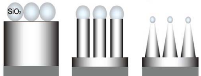
Fig. 1. Fabrication Process of Nanowires and Nanocones

Figure 1 shows the general fabrication process. Monodisperse SiO 2 nanoparticles, synthesized in-house, were assembled into a closepacked monolayer on top of a thin film layer using the Langmuir-Blodgett (LB) method. Monodisperse SiO 2 particles with diameters from 50 to 800 nm were produced by a modified Stöber synthesis. The diameter and spacing of the nanoparticles were tuned by selective and isotropic RIE of SiO 2 . The etching is based on fluorine chemistry using a mixture of O 2 and CHF 3 . Depending on specific etching condition, either Si NWs or NCs can be obtained by using Cl 2 based selective and anisotropic RIE [1]. The diameter and spacing of these nanostructures were determined by the initial nanoparticle sizes and both SiO 2 and Si etching times.