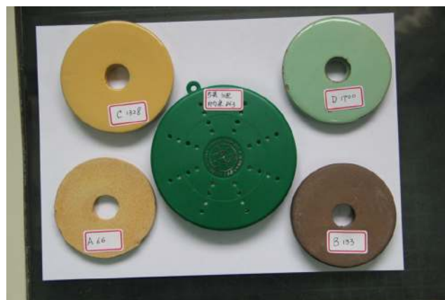
Fig. 1 Different types of biological assistant growth apparatus ceramic discs. Qiangdi nano-863 (the biggest green one in the center), Suzhou Zhongchi (a, b, c, and d discs around)

The functions of nanotechnologies in the promotion biological metabolism have been applied in many aspects. For example, seed treating or irrigation (watering) with treated water by nanotechnology devices can promote the crop growth, increase the yield, and improve the quality of many crop products, including cereal crops and cash crops. Although nanotechnology application in food and agriculture is in its budding stage, we hope to see increasing uses of tools and techniques developed by nanotechnologies in agricultural fields in the next few years (Tuteja and Singh Gill 2013).