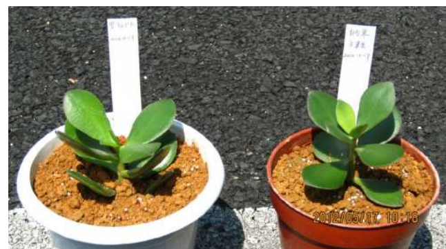
Fig. 3 Jade plant ( Crassula argentea ) treated with nanomaterial and the growth of new leaves were promoted (yellow pot) compared to the control (white pot) (10 days after treatment)