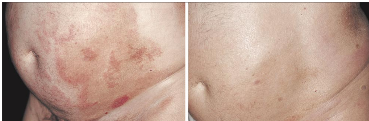
Figure 1. Patient 1. An 85-year-old man with early-stage mycosis fungoides before (left) and after (right) approximately 6 weeks of 311-nm UV-B therapy.