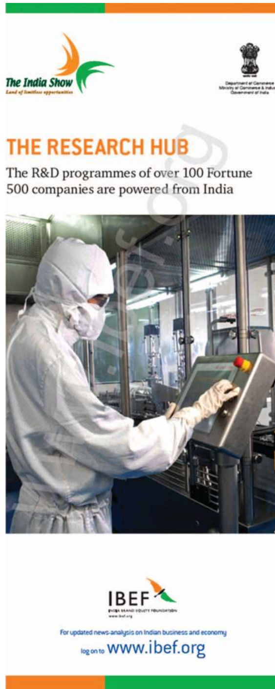
FIGURE 2. Branding India as a hub of scientific knowledge.