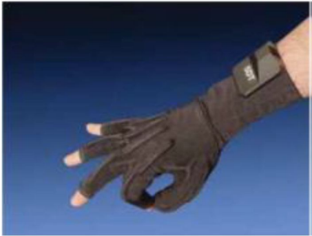
Fig. 2 Data Glove

Instrumented data glove approaches use sensor devices for capturing hand position, and motion. These approaches can easily provide exact coordinates of palm and finger's location and orientation, and hand configurations [17] [21] [22], however these approaches require the user to be connected with the computer physically [22] which obstacle the ease of interaction between users and computers, besides the price of these devices are quite expensive [22], it is inefficient for working in virtual reality [22].