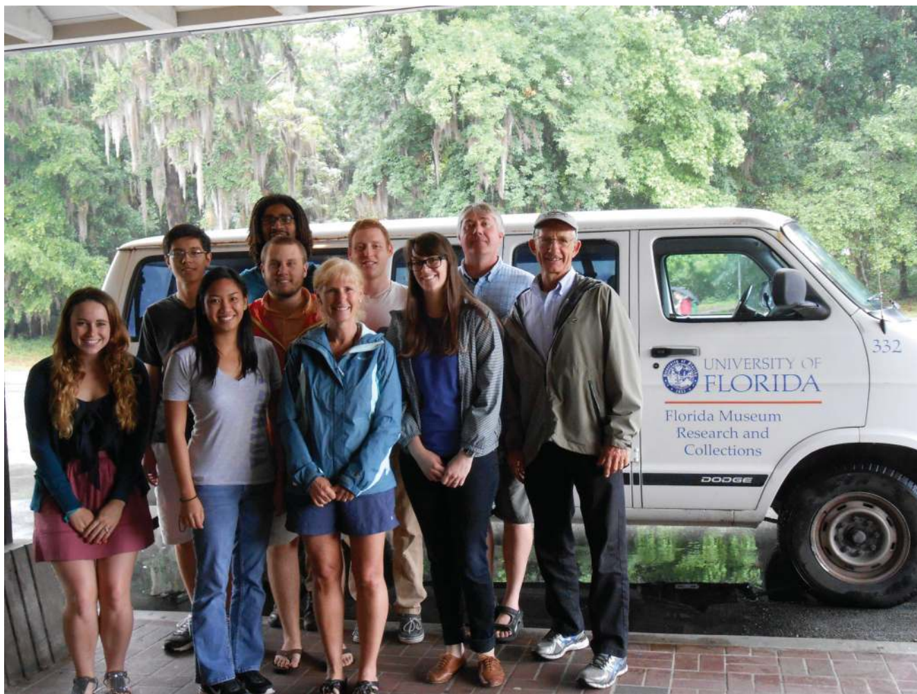
Figure 3. University of Florida undergraduate biology students on a museum field trip to collect plant specimens at the Ordway-Swisher Biological Station.

data. If they desire to do so, instructors can enhance the comparative component of the exercise by having different student groups focus on different plant species or conceptual issues. By coordinating with other instructors to conduct this exercise simultaneously at multiple institutions, students from different programs can interact online to enhance learning, foster interactions, and develop a collective and more collaborative perspective on scientific problem solving.