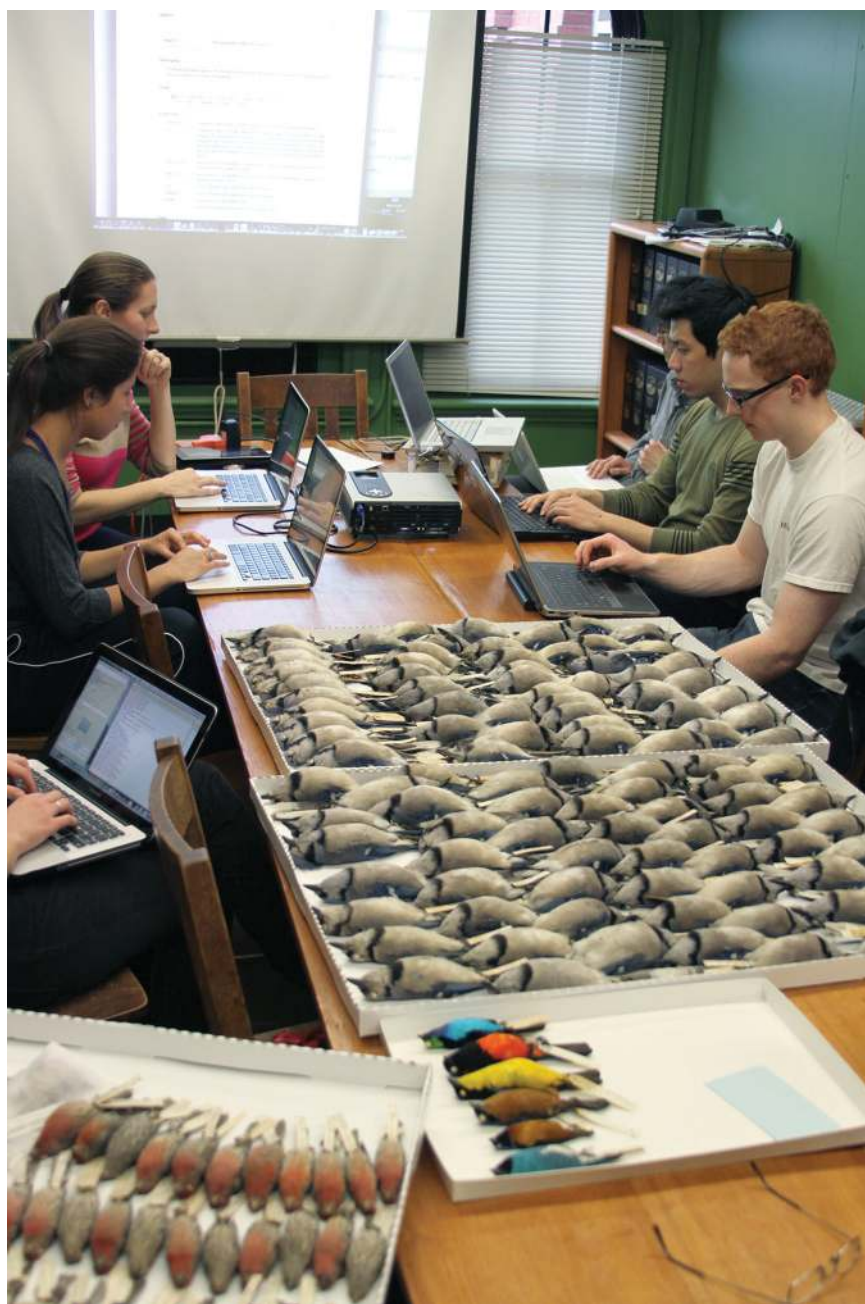
Figure 1. Undergraduate students at Harvard use specimens and associated data to explore speciation and molecular evolution in spring 2013.