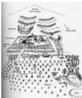
Fig. 4. A farming system created by an innovative dryland farmer in the semiarid of Zimbabwe

20-30 cm in deep and are filled with organic matter. This attracts termites, which dig channels and thus improve soil structure so that more water can infiltrate and held in the soil. By digesting the organic matter, the termites make nutrients more easily available to plants. In most cases farmers grow millet or sorghum or both in the zai. At times they sow trees directly together with the cereals in the same zai. At harvest, farmers cut the stalks off at a height of about 50-75cm, which protect the young trees from grazing animals. Farmers use anywhere from 9000 to 18000 pits per hectare, with compost applications ranging from 5, 6 to 11 t ha -1 (Reij and Waters-Bayer, 2001).