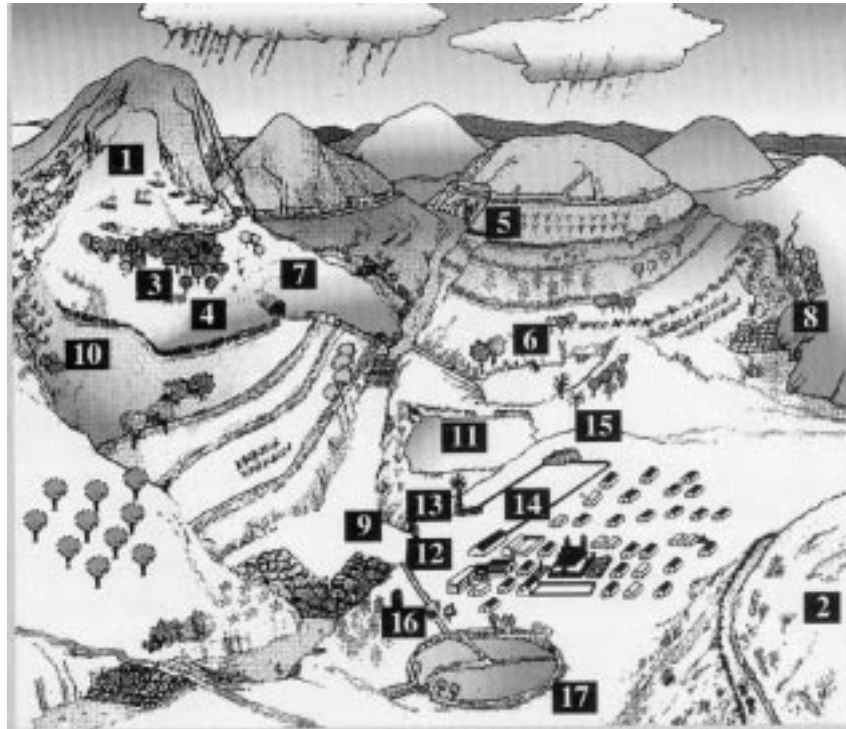
Fig. 3. Harvesting water through watershed regeneration in the Mixteca Region, Mexico To regenerate the Mixteca Region's basins, specific treatments are applied on the hills, knolls, valleys and ravines using different technologies. The work begins on the hills with retaining devices that includes ditches and trenches (1), water harvesting ring (2), reforestation (3) and contour lines with vegetation (4). On the rises where the slopes is less than on the hills, borders, terraces (5) earthen dikes (17) and watering holes (6) can be built, making it possible to water cattle and others animals or irrigate corps. If we take into account that ravines have been formed where water has most easily eroded the soil, it can be regenerated by building rock seeping dams (7) or gabion seeping dams (8). These works slow the speed and force of the initial flow with provisional water stagnation and soil retention, thus achieving control over the two natural resources involved, soil and water. The water obtained from buildings dams can be utilized by building shallow wells (16), seeping galleries and diversion dams (9) that channel part id the flow of water to agricultural land. In addition, the water in the high parts of the basins replenishes existing springs (10). One water has been gathered, irrigation systems (11) are designed as well as water storage systems that prevent its filtering and evaporating and make it available to distribute to the communities. The water can be transported to where it is used by earth- filled canals (12), unlined or lined with cement or stone. Nevertheless, the transportation of piped water (14) is the most efficient way to avoid both filtration and evaporation. Before laying the pipes, it is necessary to construct a tank (15) where the different particles in the water with settle to avoid clogging. For this work, operating costs can be cut by using alternative energy, like windmills (13) or manual pumps that will finally distribute the water to the population. After Hernández-Garciadiego and Herrerías, 1998.