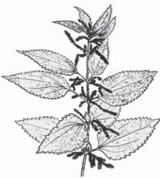
Figure 2: Urtica dioica (Stinging Nettle)