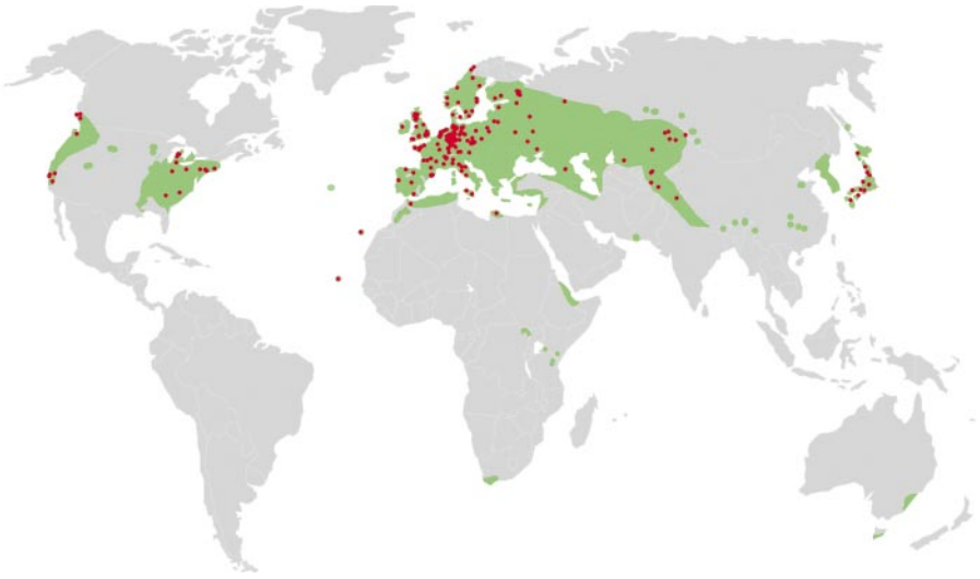
Figure 1 Geographical distribution of Arabidopsis thaliana . Green shaded areas correspond to the species distribution (8) modified according to (50). The ~300 accessions collected from different locations and publicly available through stock centers are plotted as red dots.