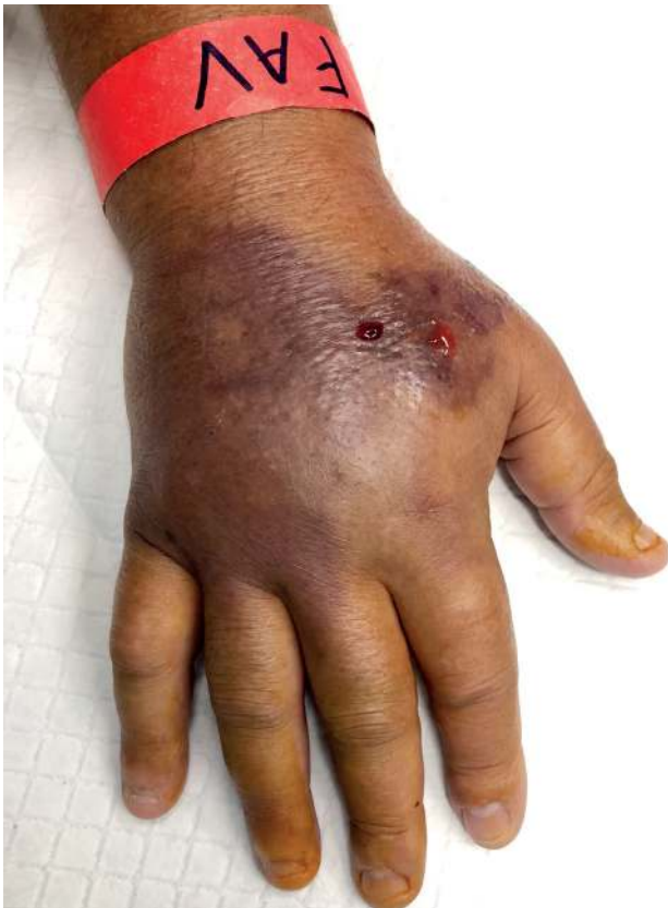
Figure 1 – Clinical presentation at admission, 12 hours after injury

the hand and forearm were skin grafted (Fig. 4). The patient was discharged from the hospital 70 days after admission after a total of six surgical interventions. A splint holding the wrist in extension was applied after ADM application until two weeks after skin graft. Daily physiotherapy was maintained for the next three months, and three times per week during the following six months. The patient was able to resume his daily life activities without restrictions. At present, he has a decreased amplitude of wrist and finger flexion (Fig. 5), but no extension restrictions.