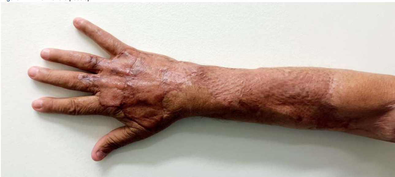
Figure 5 – Six months post-op