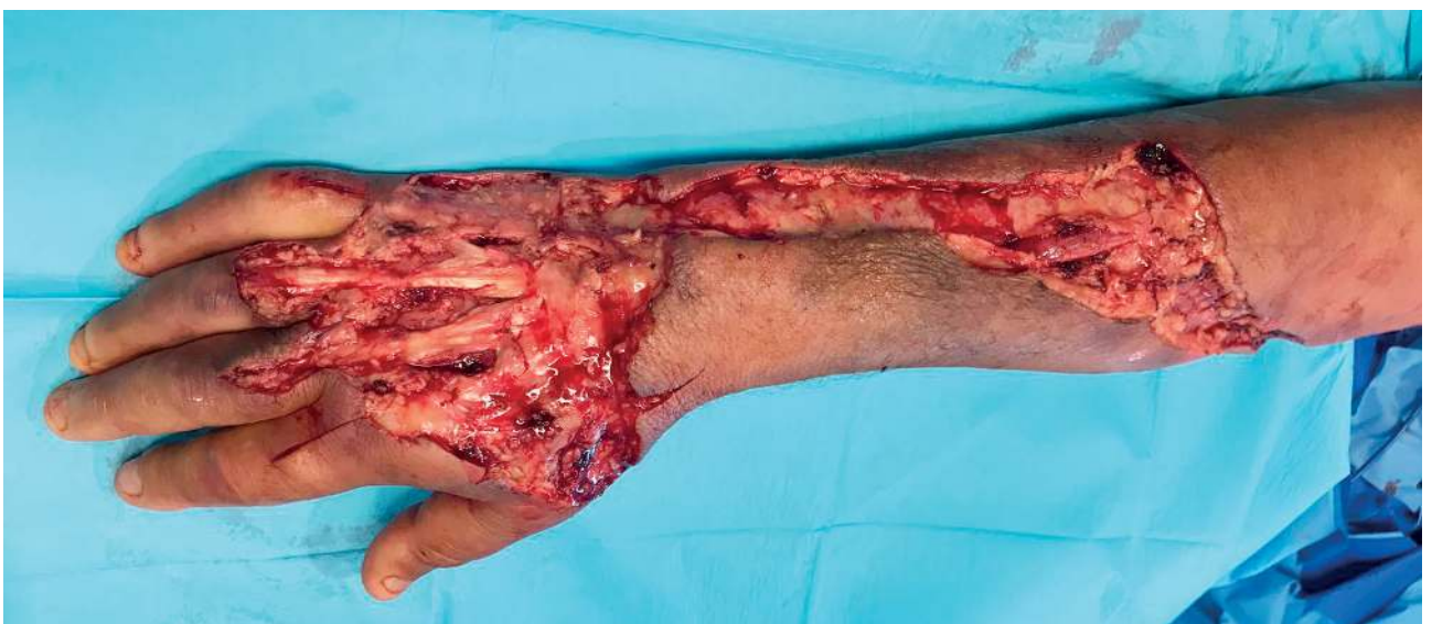
Figure 2 – Presentation after debridement

In 1981 an 'unnamed marine Vibrio ' was isolated as the