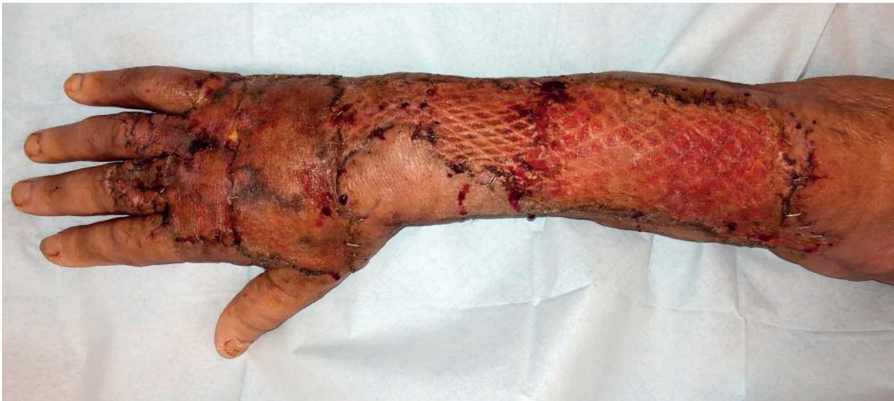
Figure 4 – Two months post-op