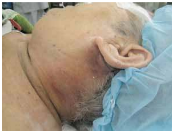
Figure 1: Necrotizing fasciitis involving the neck with post-auricular inflammation secondary to acute mastoiditis.

A 70-year-old Chinese female presented with a three-day history of painful left facial and neck swelling associated with odynophagia. She had a recent hospital admission for uncontrolled diabetes mellitus. Examination revealed a dehydrated patient with an inflamed left hemifacial region extending to the submandibular region and crossing the midline. She also had trismus. Intraoral examination revealed a left buccal ulcer and dental carries affecting the left lower canine and premolars. Ultrasonography of the neck showed an ill-defined hypochoic collection with