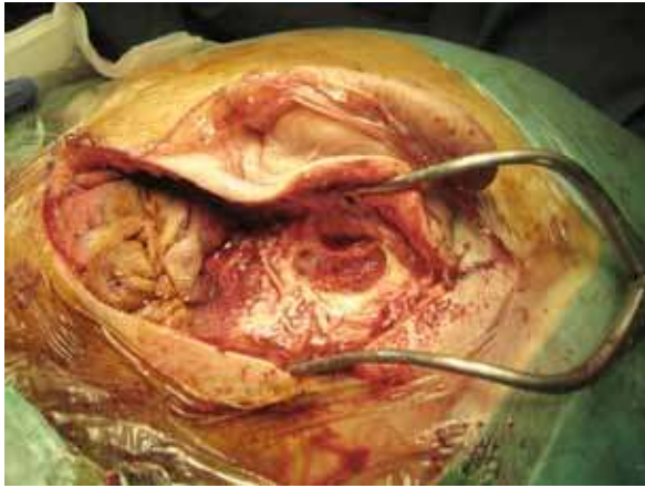
Figure 3: Cortical mastoidectomy performed concomitantly with fasciotomy.

the infection progressed to involve the larynx and mediastinum. Subsequently, she developed septicaemic multi-organ dysfunction. Family members were consulted regarding her poor prognosis, and they requested to bring her home. She then expired at home a few days later.