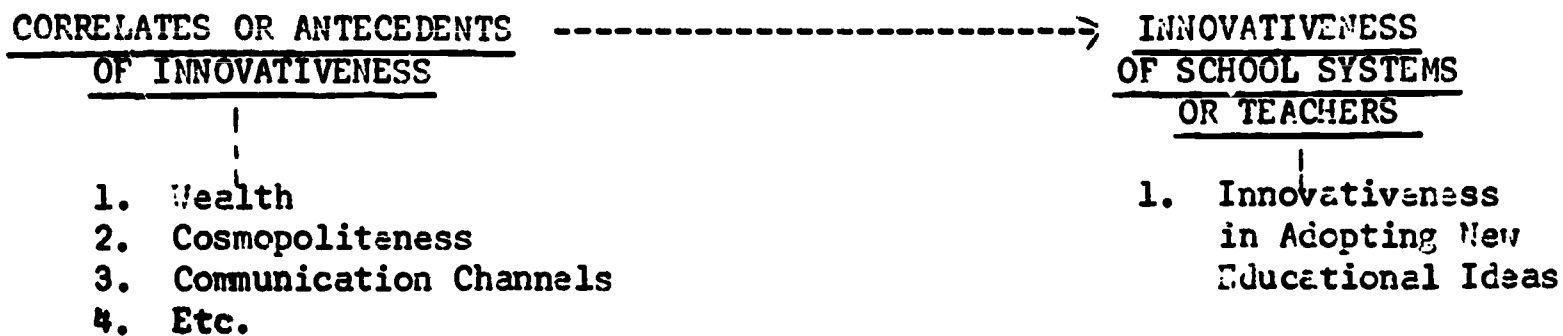
Figure 2. Model for Educational Diffusion Research Utilized by Most Past Researchers.