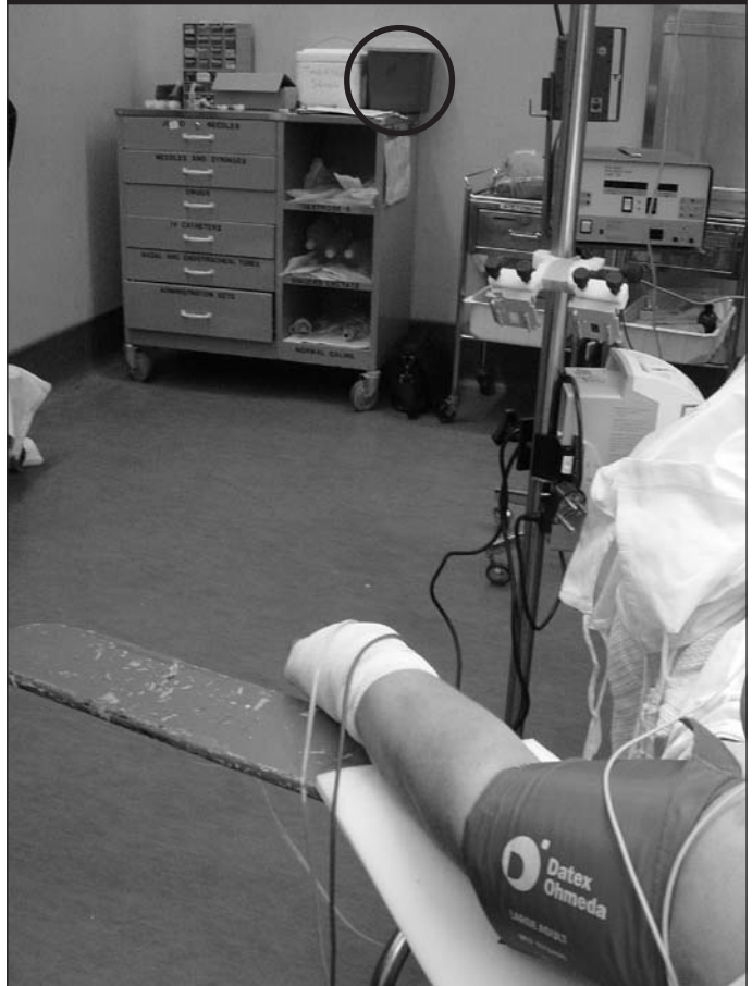
Figure 2b. Provincial hospital