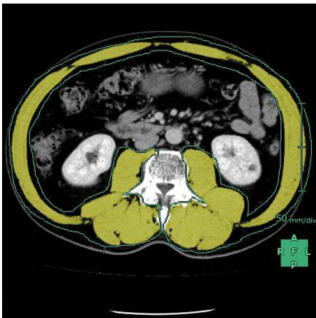
FIG. 2 Measurement of the skeletal muscle. The total muscle cross-sectional area at the middle level of the third lumbar vertebra (L3) was measured using SYNAPSE VINCENT software. The skeletal muscle was identified and quantified using Hounsfield unit thresholds (-29 to +150) (yellow zone)

maintain the minimum energy requirement. The postoperative hospital stay was 16.4 days. The postoperative complications (Clavien-Dindo grade 2 or higher) included minor pneumonia for six patients (9%) and minor