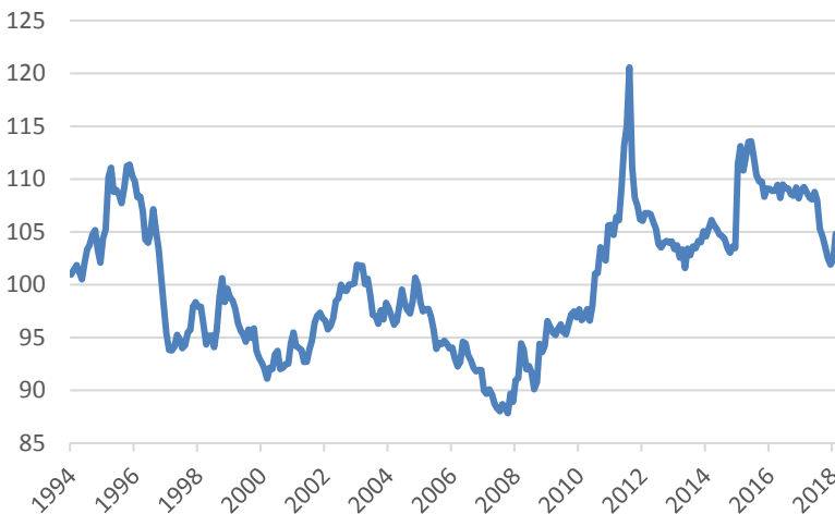
Figure 2. Real Broad Effective Exchange Rate for Switzerland

of product sophistication, and 41% of Swiss exports in 2014 was in these categories. According to OECD measures, 53% of Swiss manufacturing exports in 2014 were classified as high technology goods. This was two-to-five times higher than the corresponding values for the G7 countries. According to Thorbecke and Kato (2017), there is no evidence that an appreciation of the Swiss franc would reduce exports of the most sophisticated products, watches and pharmaceutical products. But, on the other hand, exports of specialised machinery, precision instruments, machine tools, and other goods produced using Swiss engineering are vulnerable to appreciations. Regarding the profitability of Swiss firms, exchange rate appreciations cannot only reduce export volume but also compress the profit margins of exporters by forcing them to reduce Swiss franc export prices. Their regression results indicate that a 10% appreciation of the Swiss nominal effective exchange rate caused Swiss franc export prices for capital goods to fall by 4% while for precision instruments the decline is more than 4%. On the other hand, Swiss franc prices do not fall because of an appreciation of the Swiss nominal effective exchange rate. Thus, profit margins of companies producing medium-high-technology products were squeezed, but not for companies producing high-technology-products (Thorbecke & Kato, 2017).