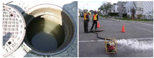
Figure 1. Flooded air-vacuum valve vault.

where Q_i = intrusion flow; C_d = coefficient of discharge; D = orifice diameter; g = gravitational acceleration; H_{\text{ext}} = external head on pipe; and H_{\text{int}} = internal line pressure. For intrusion using a leakage rate, the intrusion flow at a node is computed when the external head value (head of water above pipe – which is fixed by the user) is above the internal pipe pressure value. The leakage factor is used to set the size of the orifice. A leakage value of 20% was simulated along with an exit (or external) head of 1.4 m (2 psi). When computing intrusion volumes through pipe leaks, it was assumed that none of the air-vacuum valves were submerged and these were modeled as surge protection devices. In the model, as their actual sizes were unknown, the air-vacuum valves were sized using the AWWA rule of thumb, which recommends a 25 mm inlet size per 300 mm of pipe diameter (AWWA, 2004). Resulting inlet diameters of 25, 50, and 75 mm were obtained. For simulating intrusion through submerged air-vacuum valves, all air-vacuum valves located in the network studied area ( n = 30 ) were assumed to be submerged under 0.5 m of water in the vault. A flooded vault is illustrated in Fig. 1.