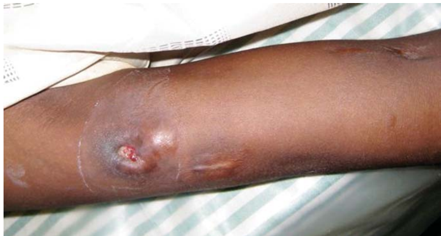
Fig. 3 Buruli ulcer. Due to undermining at the edge a large area of non-viable skin surrounds the ulcer.

Children aged 5–15 years are most at risk, but no age group is spared, and a second peak in the elderly has been observed in Benin. 94 Most cases occur towards the end of the rainy season in the humid