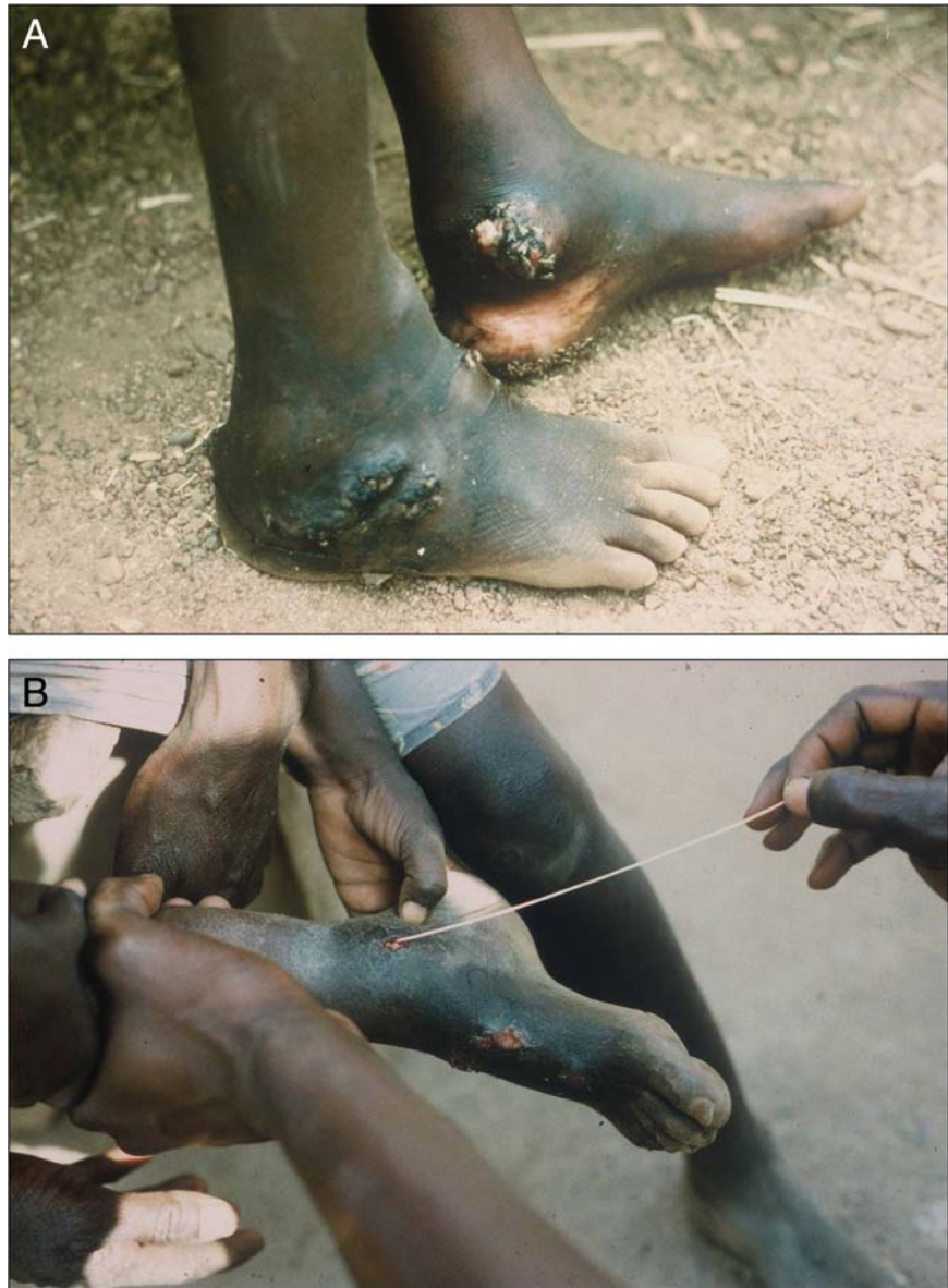
Fig. 1 Dracunculiasis. (A) An itchy blister appears following release of fluid from adult female worm located in the subcutaneous tissue. (B) A 60-cm long worm then gradually emerges over a week or two.

the use of cyclopicides, 76 the annual total worldwide incidence has dropped from 892 055 in 1989 to 2619 in 2008. 78,79 Only six countries, all in Sub-Saharan Africa, are still considered to have endemic transmission, 79 and all six have individually committed to the goal of eradication. 80